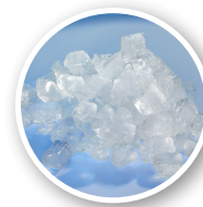
FM-8oKE-HCN Ice: Nugget