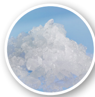
FM-8oKE-HC Ice: Flake